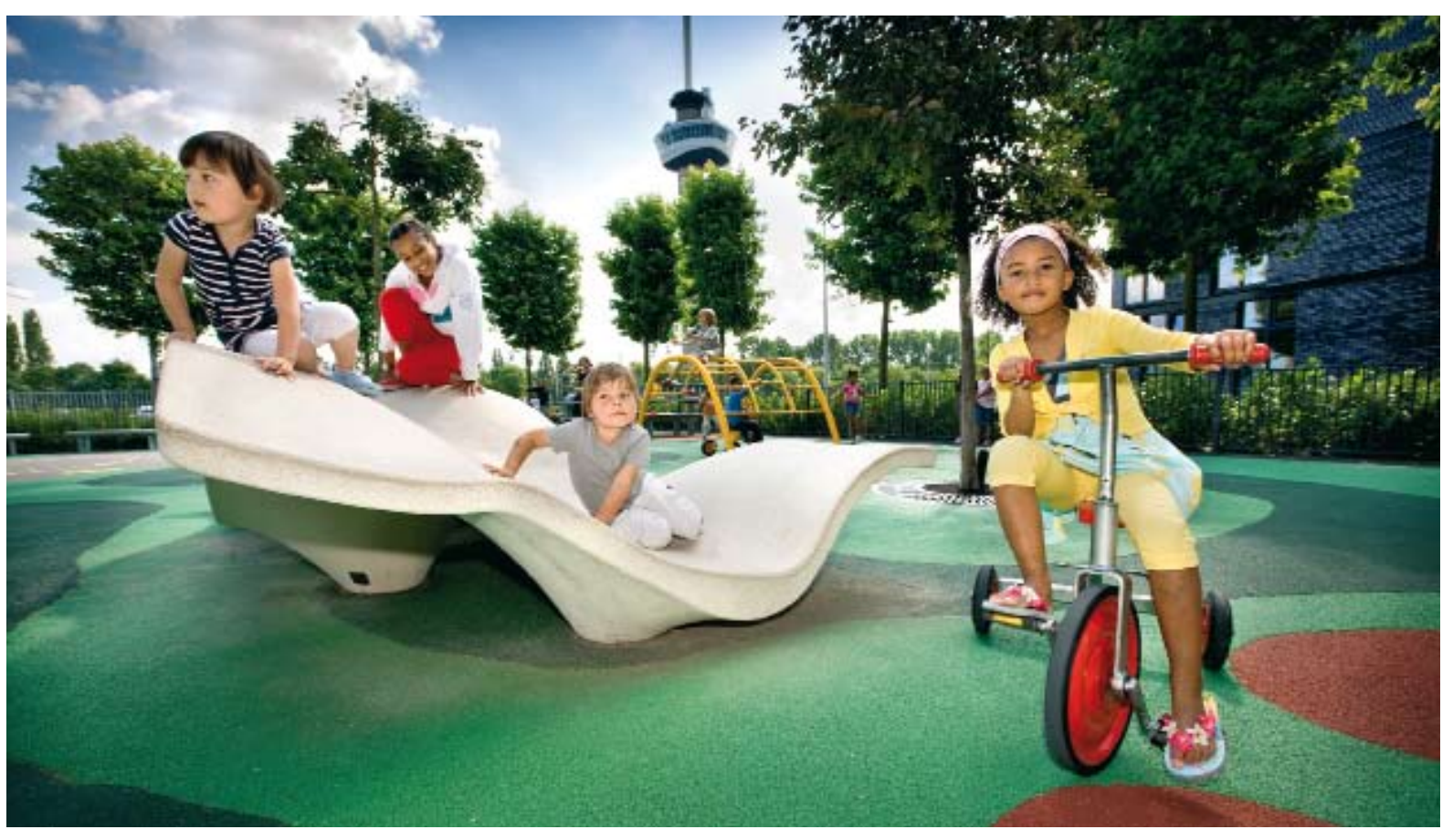
↑ | "Secret garden" play area ↓ | Children ride their bikes following the colorful

Located on the Mullerpier in Rotterdam, the site serves a schoolyard for the primary school nearby and a public square for its vicinity, which includes a home for the elderly, a business center, a theater and housing. The proposal for the playground was set up in cooperation with the school, parents, and neighbors. The demands were more green, shelter and better play areas. The final plan includes a sports area where older children can play competitive games and a smaller square where younger children can play in a diverse way. Around the square is a green hedge, which together with the green rubber underground reflects the theme of "a secret garden". The resulting site challenges children to play in diverse ways, while adults use the square as an outdoor facility of their neighborhood.