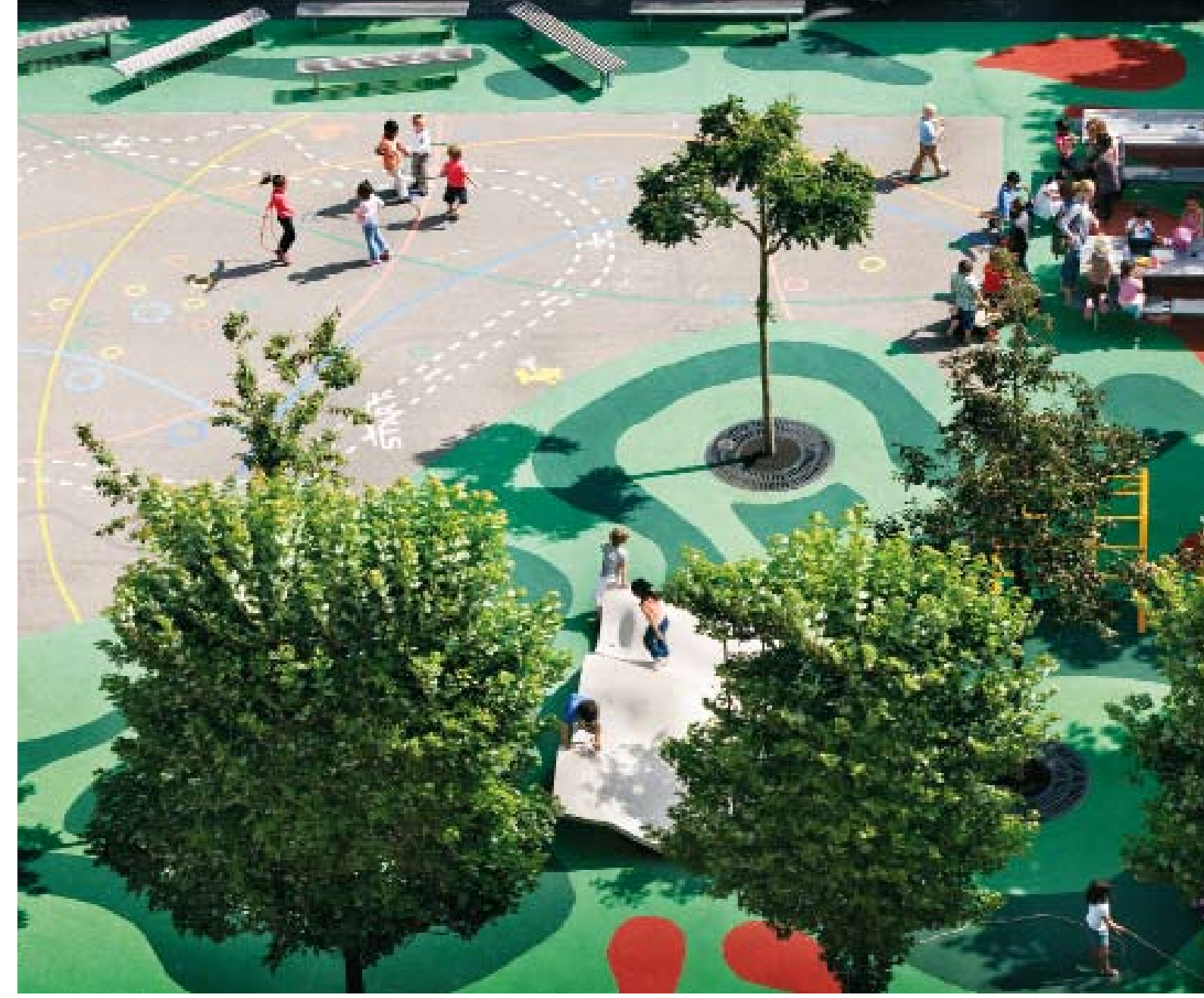
↑ | Top view of "secret garden" and sports